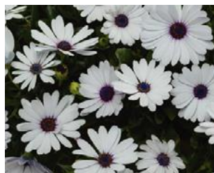
OSTICADE™ Pure White